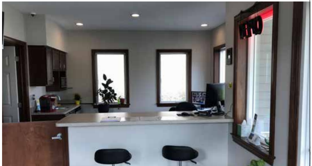
An interior view of the office shown above.