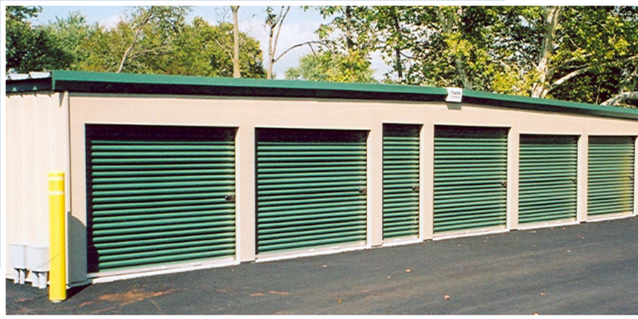
55' wide Classic Beige building with Evergreen doors.