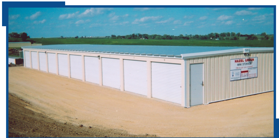
Cream Beige building with Iced White doors and trim. Note: The swing door on the end wall is for ADA compliance. (American Disability Act)